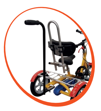
Push bar, back fixation and belt

Inside leg length 35 - 47 cm Frame height 23 cm Step through height 12 cm Cycle weight +/- 11 kg Cycle length 98 cm Cycle width 59 cm