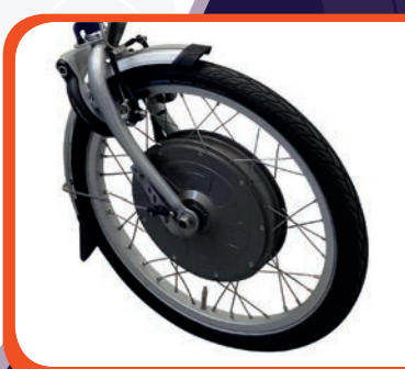
Silent HT VR2F