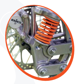
Suspension and hydraulic brakes