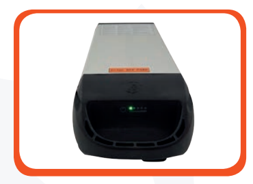
Cube Heavy accu ± 25 Ah