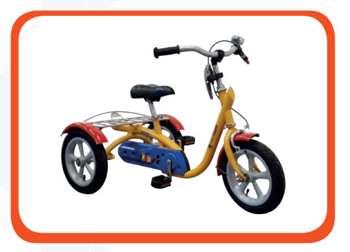
The Husky tricycle is suitable for children aged 2 and above.