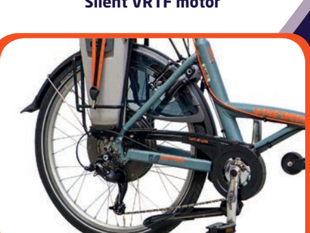
Silent HT VR2R