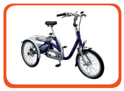
The Midi tricycle is suitable for children around 8 or older, or for shorter adults.

As the frame of a tricycle is not inclined at the bend, it may be slightly more difficult to get used to riding this type of bicycle. Because these bicycles have one front wheel they can be manoeuvred more easily, this is also because these bikes are equipped with a differential. Van Raam has different sizes of this type of tricycle.