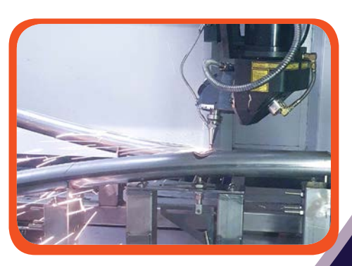
3. 3D laser cutting