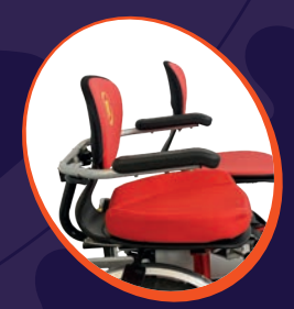
Thick seatpillow (5 cm)