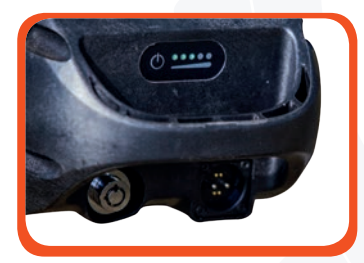
Rosenberg connector with battery indication