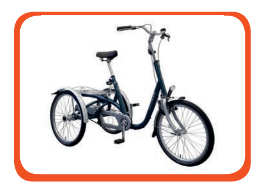
The Maxi tricycle is suitable for adults who have a difficulty keeping their balance.