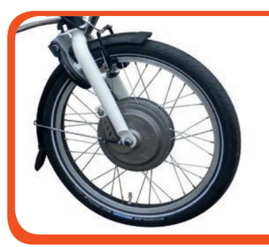
Silent VR1F motor