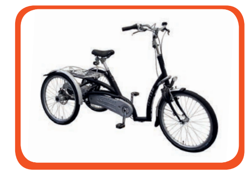
The Maxi Comfort is a low step through tricycle for adults.