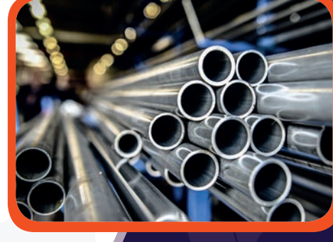
2. Steel pipes