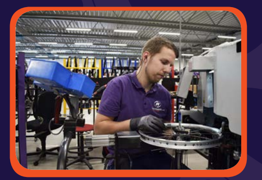
11. Spoke machine