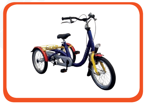
The Mini tricycle is suitable for children aged 4 and above.