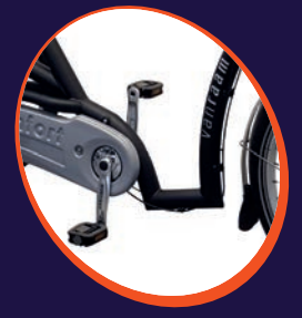
Low step through

Step through height 23 cm Cycle weight +/- 32 kg Cycle length 194 cm Cycle width 75 cm