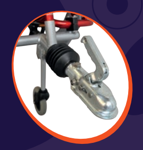
Hydraulic overrun brake

Seat height 61 cm Step through height None Cycle weight +/- 67 kg Cycle length 197 cm Cycle width 113 cm