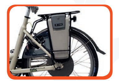
Slim battery ± 13 Ah

Van Raam uses Lithium ion batteries with 10,7, 13.6 or 24.8 amp per hour and 36 volt. Thus a capacity of 1.785 Watt hour (WH) can be reached. The batteries and the special software are manufactured in the Netherlands. In practically all cycles, two battery packs can be optionally installed. The batteries are easy to remove from the bike and can be charged on the bike or at home.