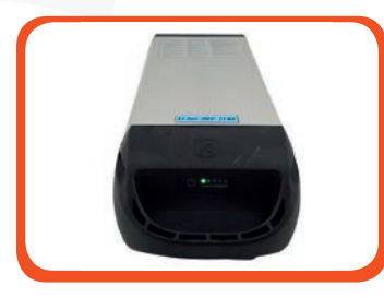
Cube battery ± 11 Ah